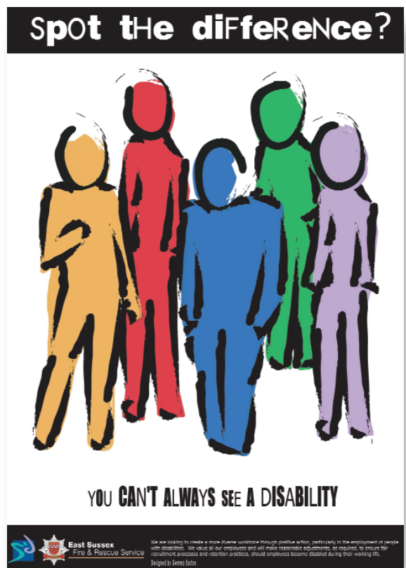
A disability awareness campaign poster

CFOA is committed to raising performance and skill levels in key areas such as project and programme management, financial management and human resources. We want to promote continuous improvement through challenging existing processes and procedures and encouraging partnership working and learning from best practice.