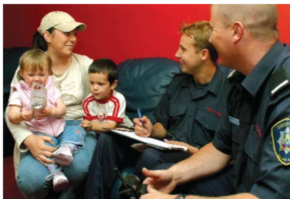
Promoting fire safety awareness in the community

The strategy is designed to enable the Fire and Rescue Service to achieve its primary purpose, live up to its core values and to deliver its vision