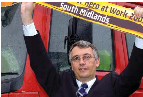
Award winning standards