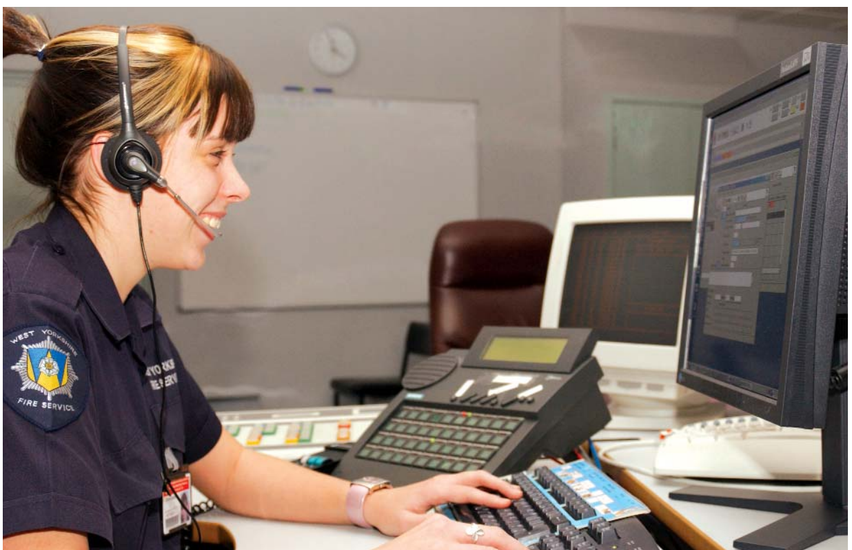
Dispatching the crews

The Strategy and Action Plan will be reviewed on an annual basis. Progress will be monitored by the CFOA Board and regular reports to the Practitioner's Forum.