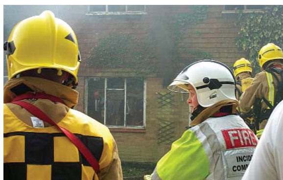
Leadership in action