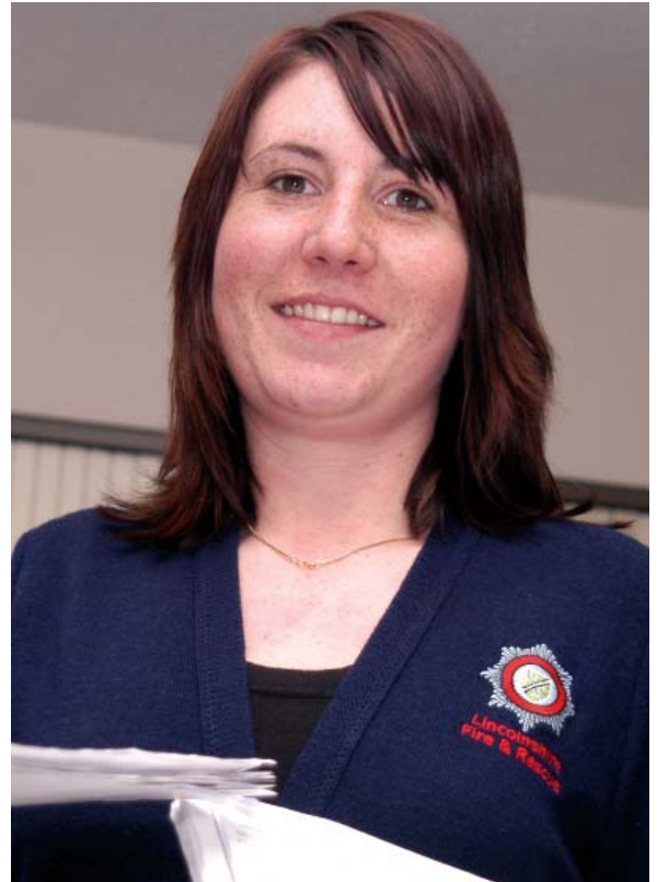
Employer of choice