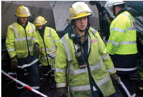
Rescue at Hatfield

We need to invest in the people management and development skills within the Fire and Rescue Service to create the intellectual capacity to enable the Service to be transformed. It is crucial that we develop the HR role from being predominantly advisory and transactional, to becoming a more strategic partner and key advisor to the Service.