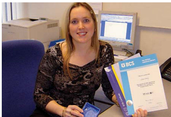
Continuous personal development